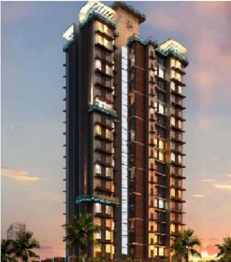
Heritage Tower, Mumbai